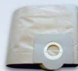
Dust bag ref. OSC 207