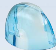
Vacuum nozzle ref. OSC 320