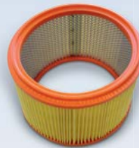
HEPA filter ref. OSC 208-2