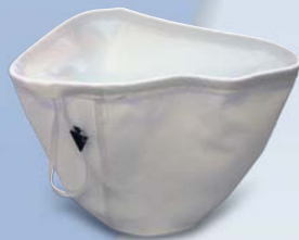
Polyester filter ref. OSC 208-1