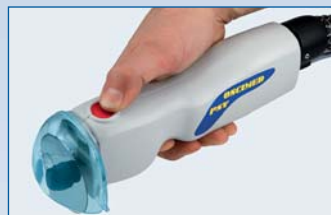
Simple sensor switch access