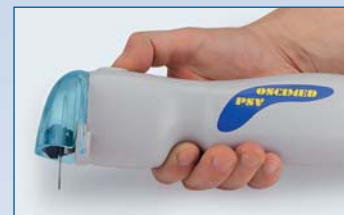
Easy to use with one hand even with the dust extraction