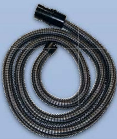
Vacuum cleaner hose ref. OSC 311