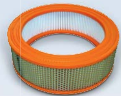
HEPA filter ref. OSC 208-3

OSCIMED vacuum cleaner for PSV saw with European plug: ref. OSC 206-V00 OSCIMED vacuum cleaner for PSV saw with British plug: ref. OSC 206-V00-UK OSCIMED 120V/60 Hz vacuum cleaner for PSV saw with U.S. plug: ref. OSC 206-V00-US